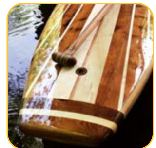
Other Industrial Applications

Cutting Plastic, Acrylic, ACM or other Sign Making Material?