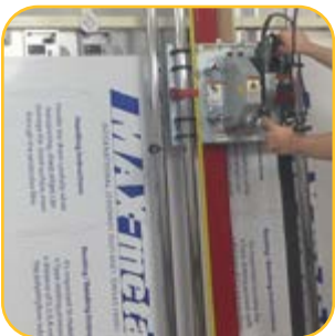
Sign Makers, www.signsaw.com

Our machines give operators the ability to effectively process a wide variety of material while only requiring one person to operate the machine saving valuable time, material and money. Below are a few industries that use our machines to process panels.