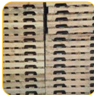
Crate and Box Makers