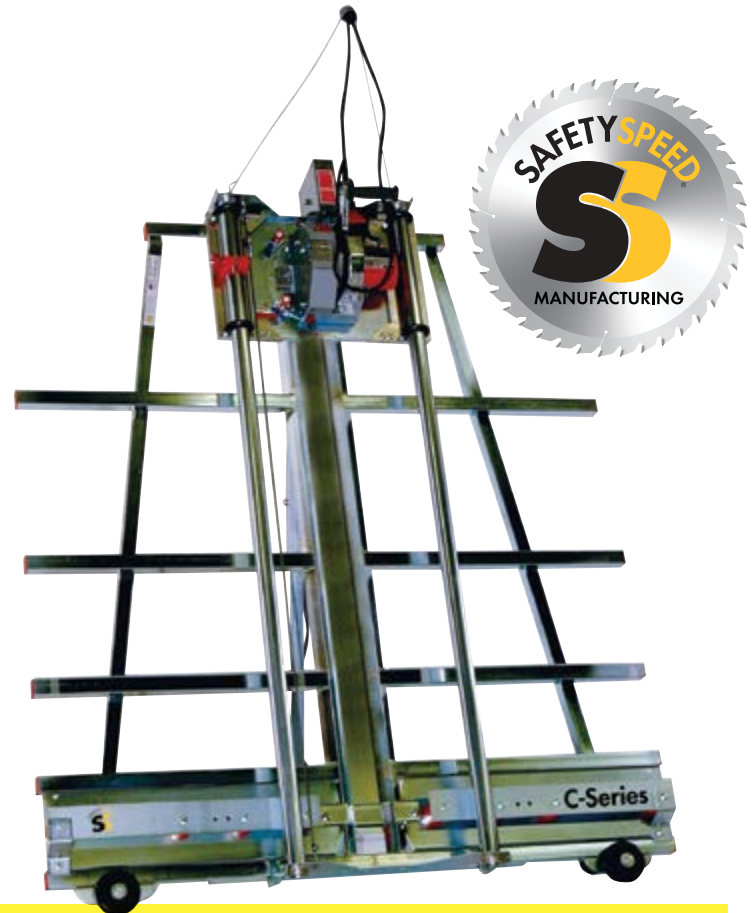
This photo is shown with wheels, an optional accessory. Discounted accessory packages can be found on Page 5. Capabilities of each accessory can be found on Page 9. 2" depth of cut is available upon request and is an additional charge