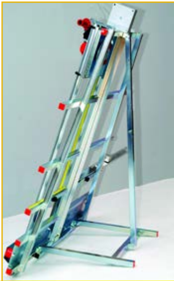
An optional folding stand allows these machines to be moved all over your shop

The C-Series provide the ideal solution for cutting 4' X 8' panels, while the C5 cuts sheets up to 64" tall, simplifying the rip and crosscut processes.