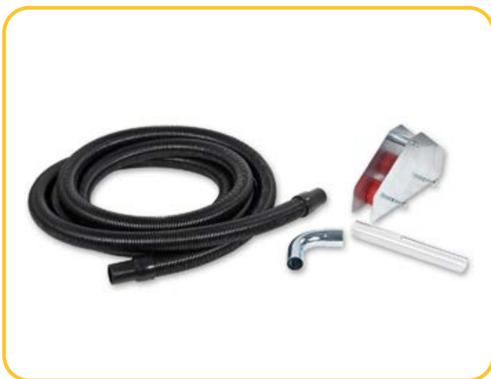
Dust Collection Kit

Includes: hose, elbow, dust tube and rollers