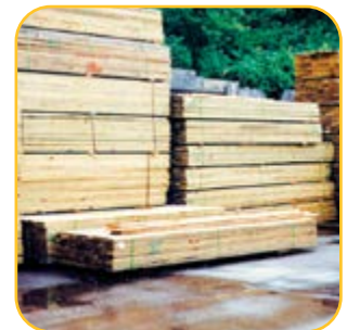
Lumber Yards and Home Centers